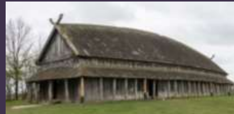
The inside and outside of a Longhouse

The first big Viking attack on Britain was a raid in Northumbria in 793. The Vikings came to steal gold and silver from the churches.