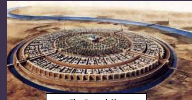
The Round City The Golden Age of Islam