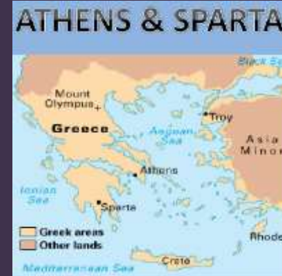
ATHENS & SPARTA