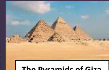
The Pyramids of Giza