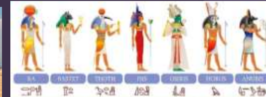
Egyptian Gods and Goddesses