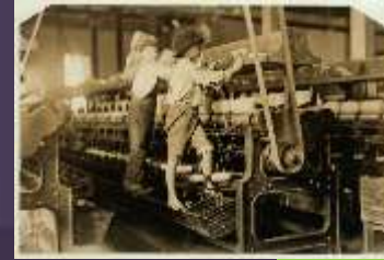
A young children working in a cotton mill