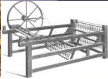
The Spinning Jenny