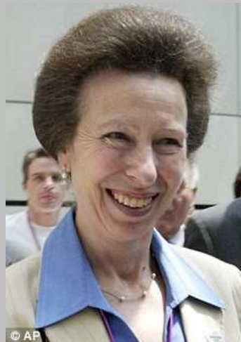
Princess Anne Princess Royal