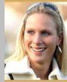
Zara Anne Elizabeth Phillips,