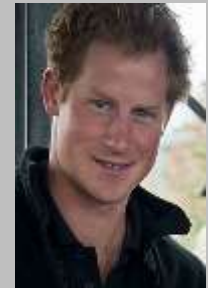
Prince Henry of Wales