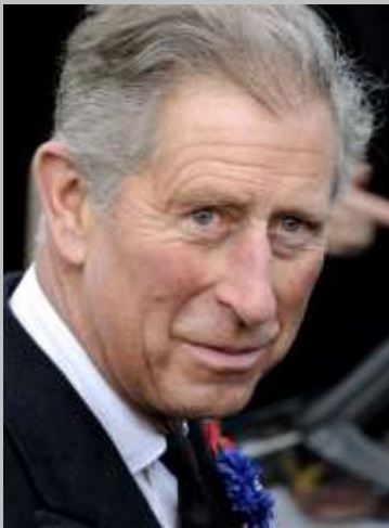
Prince Charles The Prince of Wales

The Queen and Prince Phillip have 4 children: