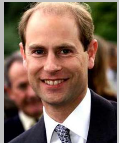
Prince Edward Earl of Wessex