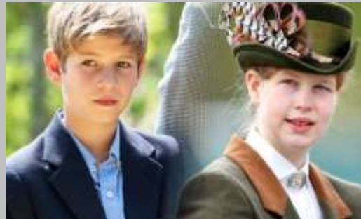
Lady Louise Mountbatten-Windsor