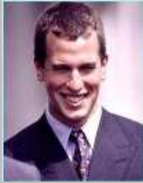
Peter Mark Andrew Phillips,