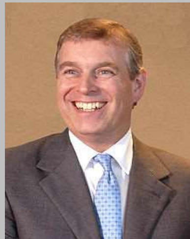
Prince Andrew Duke of York