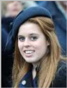
Princess Beatrice of York,