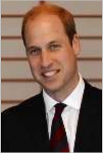
Prince William of Wales,