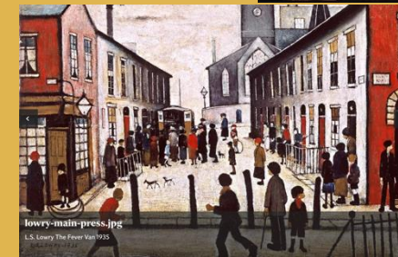
lowry-main-press.jpg L.S. Lowry The Fever Van 1925