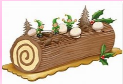
Une bûche de Noël